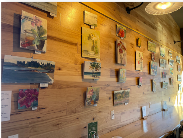
The art of Ena Sanchez-Raml, as displayed January - February, 2022, illustrates great spacing and utilization of the gallery wall.