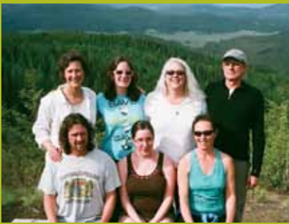
Moscow Food Co-op Board of Directors